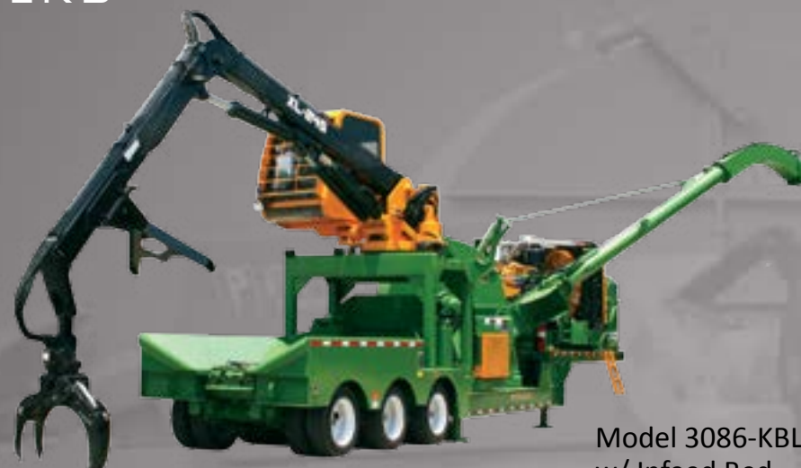
Model 3086-KBL w/ Infeed Bed

All four sizes of Precision Whole Tree Chippers have rugged frame construction, over-sized stabilizers, air compressors, trash separators and more powerful fans that pack more chips per van. Power options range from 400 to 1050 horsepower [298 to 783 kw]. Because Precision Whole Tree Chippers are built stronger, have more standard features, with a reputation of trouble-free service, it is the choice of experienced operators and owners.